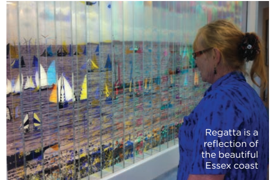
Regatta is a reflection of the beautiful Essex coast

Regatta is a specially commissioned artwork which is located on the ground floor of the link between the Radiotherapy Centre and the main building at Colchester General Hospital. Many studies have shown that art in hospitals can have a very soothing and therapeutic effect, reducing anxiety and stress - we think that Regatta will do just that! Special glass fins across the surface of the piece change the colours that you see, making it fascinating to view at different times of day. In addition, the names of people who have given to the Cancer Centre Campaign will be engraved on the glass fins, making this a stunning way to acknowledge their generous support. Please do take the opportunity of seeing it when you visit Colchester General Hospital.